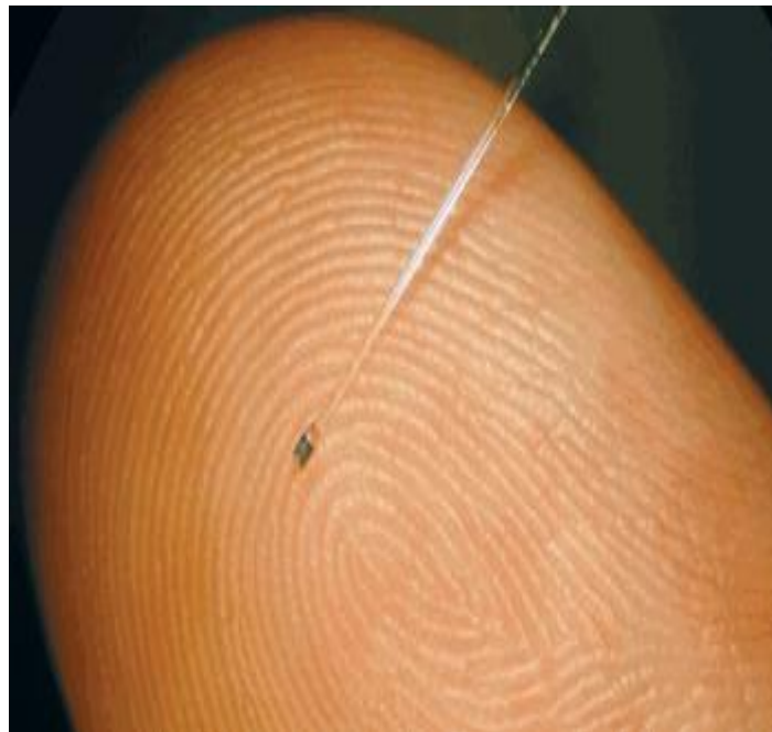
FIGURE. Sensors intended for implanting or indwelling applications must be very small such as this micro-miniature fiber-optic pressure sensor shown on a fingertip.

measuring exterior of the body - like as laboratory blood tests. From the perception of how optical sensors are applied to a patient, they can be classified as non-invasive, contacting, minimally invasive, or invasive. Biomedical optical sensors can be used in humans, in animals, or other living organisms and depending on the intended use, can be for diagnostic, therapeutic, or rigorous care in clinical uses; research and preclinical growth; or laboratory testing (see Table 1).